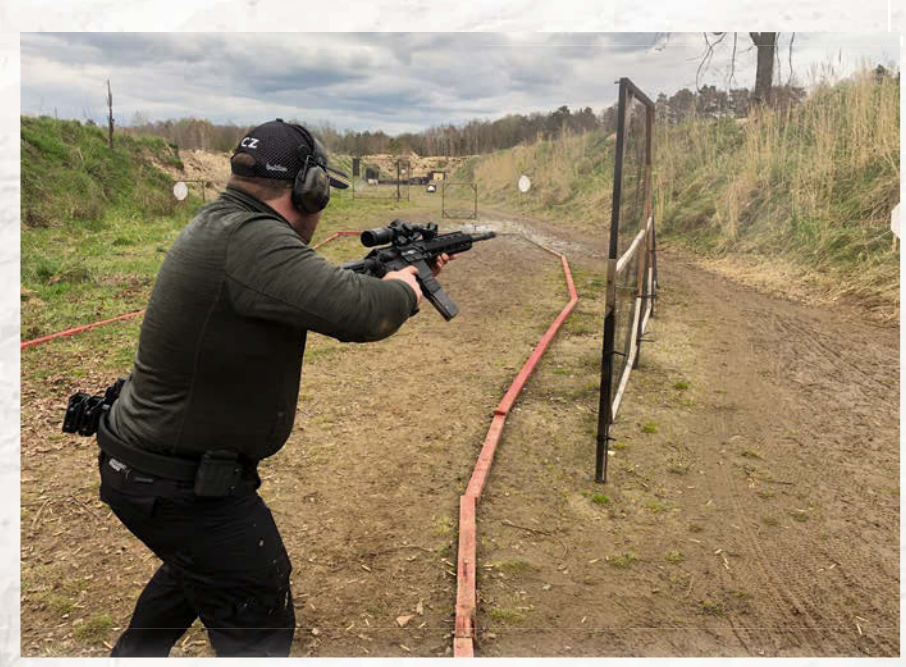
Here one of the participants in the IPSC Rifle 2023 fires at targets on the right while running forward on a running course.

Just the adrenaline released above normal levels. that pushes the body into a mixture of extreme attention, tension and expectation. After our squad got through this beginning without any collateral damage, the match resumed its normal course. There were 7 stages scheduled in the morning and the remaining 5 in the afternoon. There was a long break in between, which was due to a traffic jam in front of a complex medium course. Its paper targets, located 310 m away, had to be approached and taped off after each pass by a range officer using an emountain bike. This cost time and made the e-bike increasingly dirty because of the many puddles.