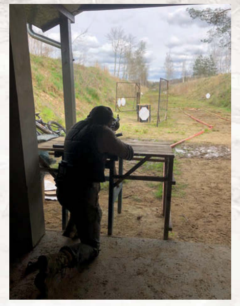
Starting position in a course with 300 meter targets, which are shot at from a supported position.

That meant a minimum of 40 rounds with the barrel fired hot afterwards. At first things seemed complicated. We had to remember at least 20 targets and if we forgot or ignored one, it would almost certainly not be shot at later in the course. We had a 5 minute walkthrough. Slowly, after the 2nd or 3rd run, a simple and smooth running strategy emerged to complete the course safely and completely. The angles weren't a problem either because the chosen running strategy didn't come into conflict with the small, "forbidden" rest of the circle segment. Start. After the beep slightly to the left, 2 slices down, to the right 300 degrees