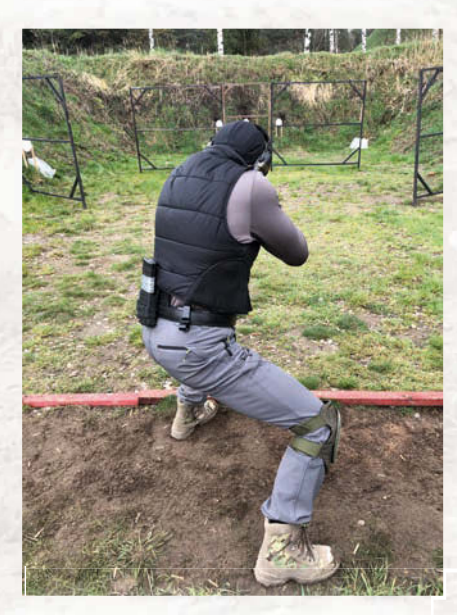
Shooting at targets located approximately 25 meters away in a standing position through a gap in the cover in front of the targets.

Sometimes you just don't have the support of a frame or the ability to shoot with a bipod while lying down. The first target was to shoot at an IPSC target through a nasty window while kneeling or crouching, followed by two targets about 1 m away (fair compensation) and more paper targets. The first exercise of the day is always the most exciting, although not the most difficult: