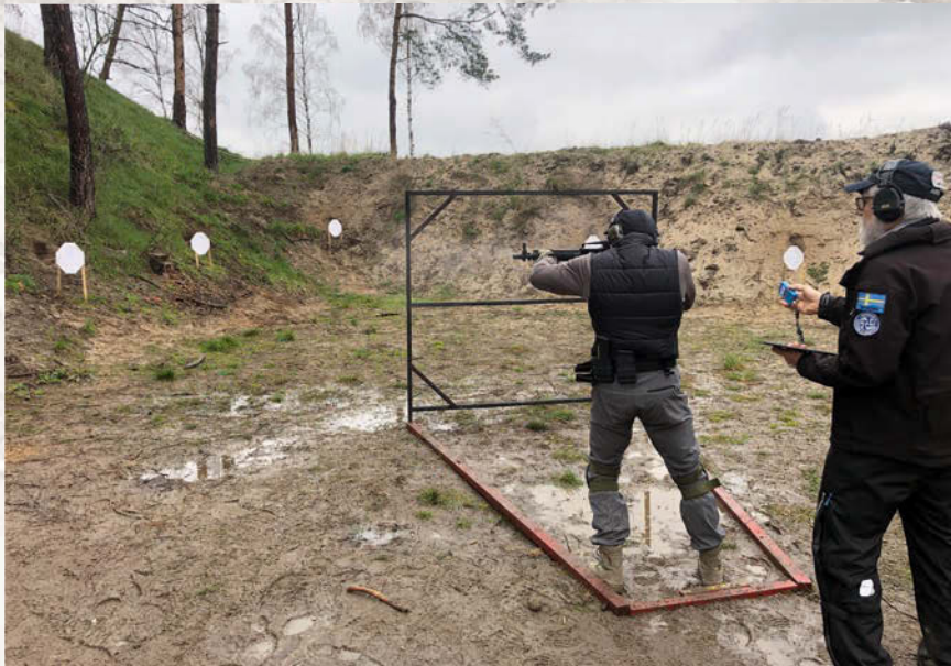
And at times the atmosphere of the competition in Wiechlice resembled that of a mud fight: short course with a minimum of 12 shots and difficult movement in the demarcated course due to the soft ground.

That meant a minimum of 40 rounds with the barrel fired hot afterwards. At first things seemed complicated. We had to remember at least 20 targets and if we forgot or ignored one, it would almost certainly not be shot at later in the course. We had a 5 minute walkthrough. Slowly, after the 2nd or 3rd run, a simple and smooth running strategy emerged to complete the course safely and completely. The angles weren't a problem either because the chosen running strategy didn't come into conflict with the small, "forbidden" rest of the circle segment. Start. After the beep slightly to the left, 2 slices down, to the right 300 degrees